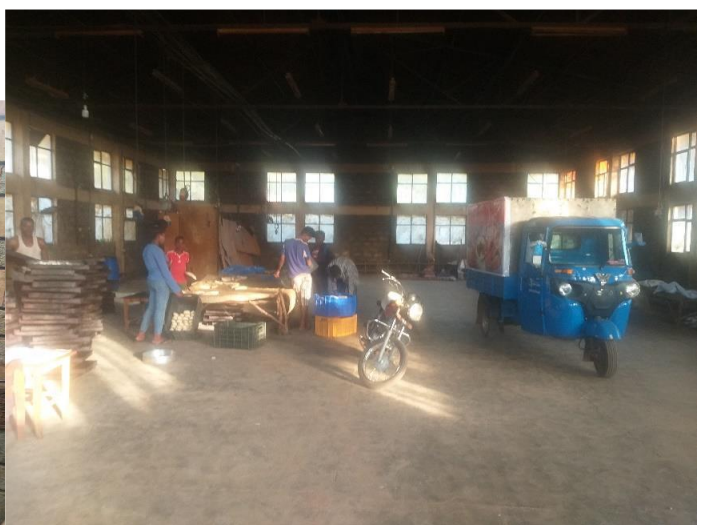
Minitaxi with open loading surface (sales point) – The new minitaxi at work (Emmanuel food production workshop)