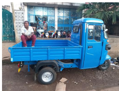
Our dream with more load capacity