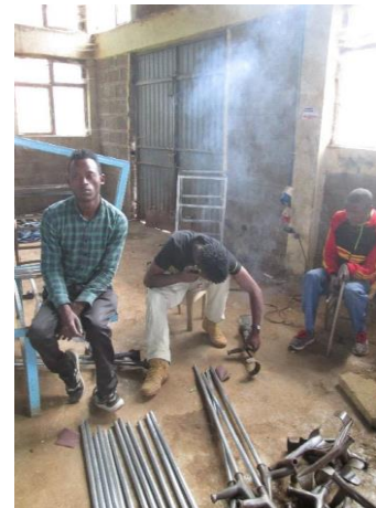
Manufacturing mobility aids: Wheelchairs – Wooden “American” crutches – Metal crutches