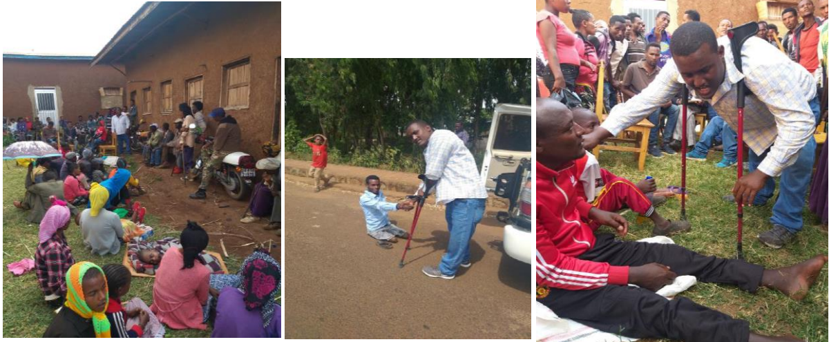
Checking needs in Kambatta – many disabled persons waiting for mobility aids or orthopedic operations, braces, leg prostheses

The Mother Theresa nurses in the 500-bed Sidst Kilo Hospital, Addis Abeba also received crutches and wheelchairs as gifts. The nuns are very committed to helping the poorest of the poor in many Ethiopian cities, and it is a privilege for Emmanuel to be able to support their service by delivering mobility aids.