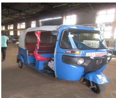
The good old first Minitaxi