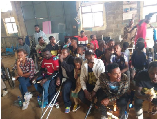
Members of Project Emmanuel

My disabled friends in Soddo also specifically instructed me to pass on their warm greetings and thanks for all of your support, your gifts and your prayers. These are a great encouragement for many disabled persons in Ethiopia, they are life-changing help and they give these people a new life perspective ☺!