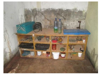
Tidied up the Swiss way!