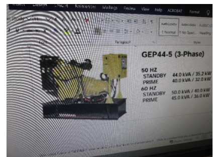
The generator offered by SCH