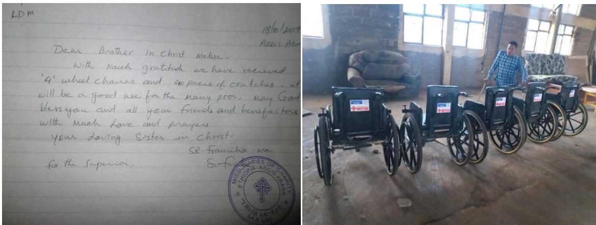
Acknowledgment of receipt from the Mother Theresa Hospital Sidst Kilo 10/2019 - Wheelchairs for the Mother Theresa Hospital in Addis

The Mother Theresa nurses in the 500-bed Sidst Kilo Hospital, Addis Abeba also received crutches and wheelchairs as gifts. The nuns are very committed to helping the poorest of the poor in many Ethiopian cities, and it is a privilege for Emmanuel to be able to support their service by delivering mobility aids.